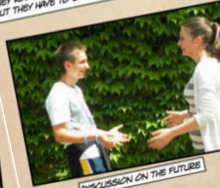
left side, above: "future workshop", photo group left side below: "future workshop", welding group right side, above: "future workshop", photo group right side centre: "future workshop", filming group right side, below: "future workshop", photo group

THEY WANT TO OPEN THE EUROPEAN GATE, BUT THEY HAVE TO STICK TOGETHER.