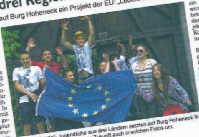
„Europa für alle“: Jugendliche aus drei Ländern setzten auf Burg Hoheneck ihre Visionen einer gemeinsamen Zukunft auch in solchen Fotos um.

Zwei Wochen treffen sich jeweils zehn junge Leute zwischen 16 und 22 Jahren aus den Ländern der trinationalen Partnerschaft in Mittelfranken. Unter dem Motto „Europa für alle“ entwickelten sie seit Montag ihre Visionen auf Burg Hoheneck. In Workshops ging es darum, diese mit Fotos, einem Film und einer gemeinsam geschaffenen Skulptur auszudrücken. Die Ergebnisse wurden am Donnerstagabend vorgestellt. „Die Gruppe war fast vollständig schon vor einem Jahr im Limousin zusammen. Im nächsten Jahr wird sie sich in Pommern treffen“ betonte Bertram Höfer, Vorsitzende des Bezirksjugendrings, der das Projekt organisiert. „Wir wollen diese Kontakte zwischen den Teilnehmer nachhaltig verankern.“