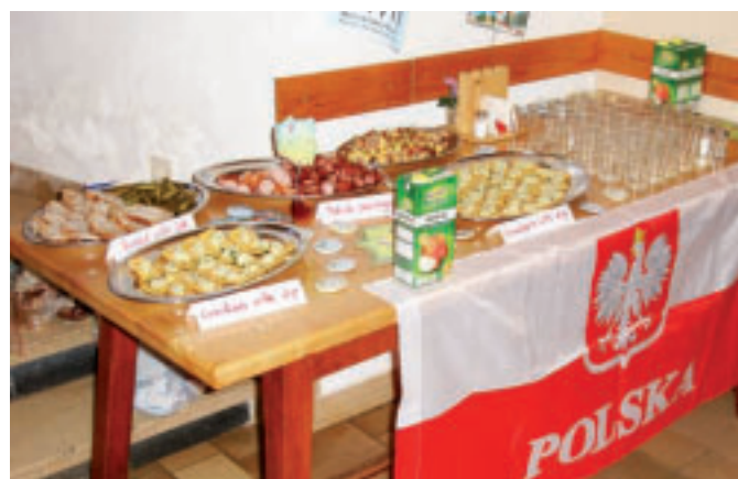
Part of the European dinner, prepared by the participants